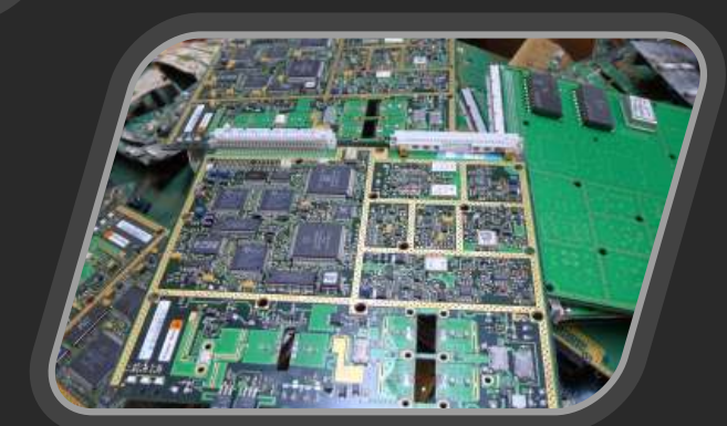
Electrical and electronic scraps