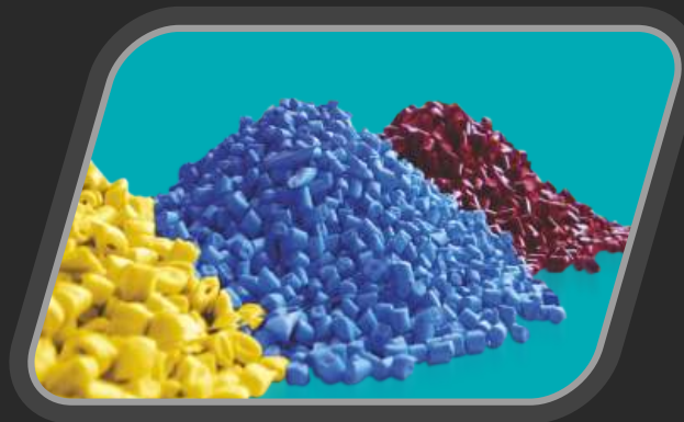
Plastic granules & products