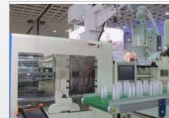
Injection molding Industry