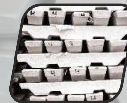
Aluminium Alloys (Manufacturers)