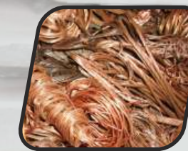
Ferrous & Non-ferrous scraps (Traders)