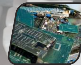
PCB e-waste (Recyclers)