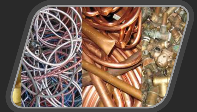
Ferrous and non-ferrous metal scraps