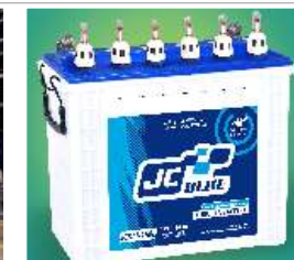
Lead Acid Battery